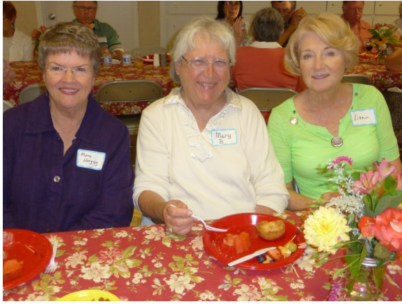
Great time had by all at our Annual Wine Draw Event